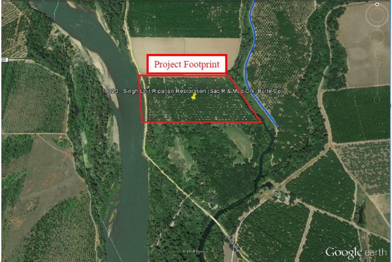
3) Approximate project footprint map

(Note: The project footprint must show the maximum extent of the proposed project in addition to staging areas and access routes if applicable. Two aerial maps may be required if staging areas and access routes are not adjacent to the main project footprint.)